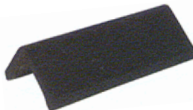
High Pitch Concrete Angle Ridge

Suitable for roof pitches approx 37° to 50°