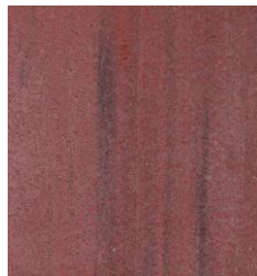
Country Red Lacquered

Available in all tiles except Senior Slate