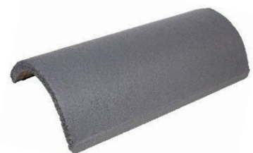
Half Round Concrete Ridge

Suitable for roof pitches up to approx 55°