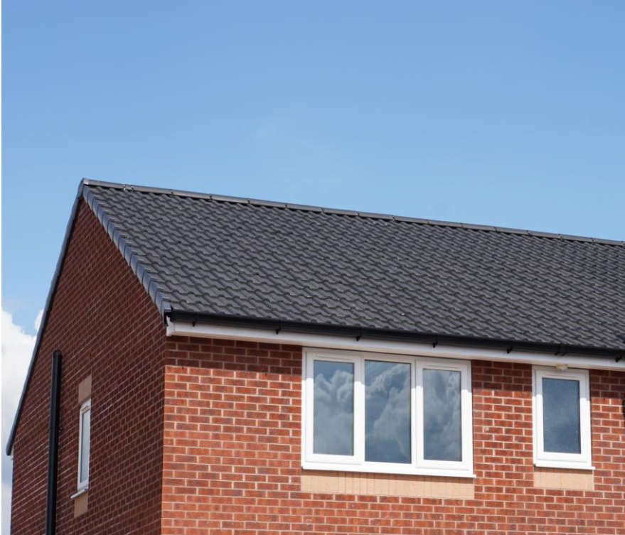
Black DR Dinnington Sheffield