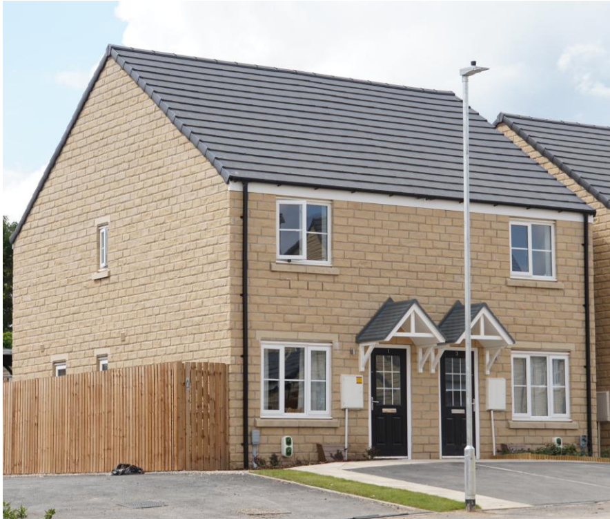
Grey Concrete Slates Flockton Huddersfield