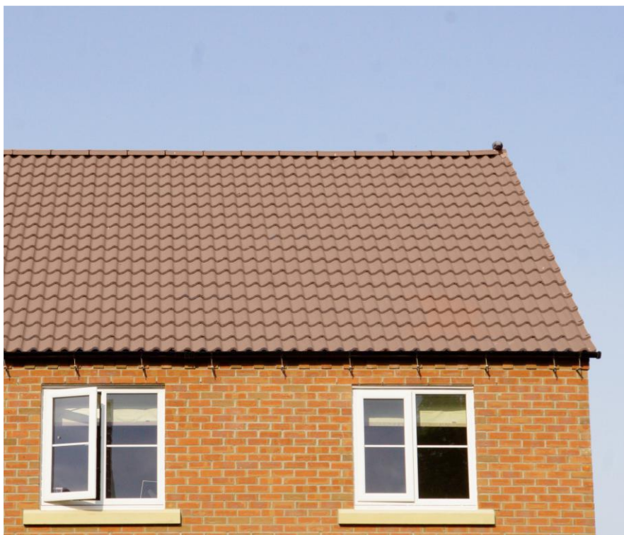
New Brown Low Pitch Pantile