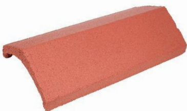
Universal Concrete Angle Ridge

Suitable for roof pitches up to approx 37°