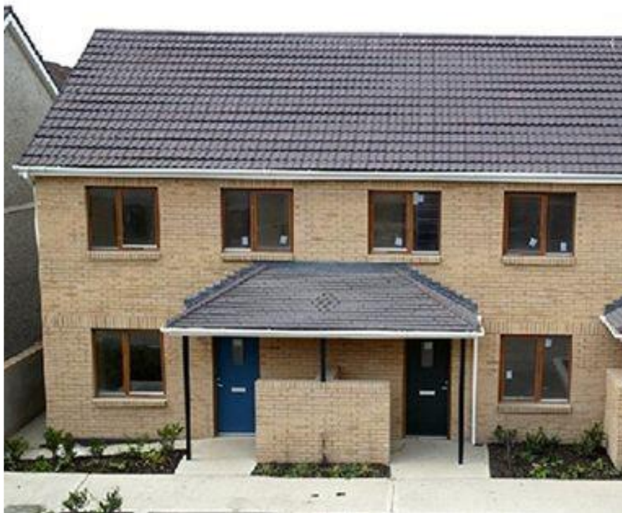
Grey 'M' Profile Tile