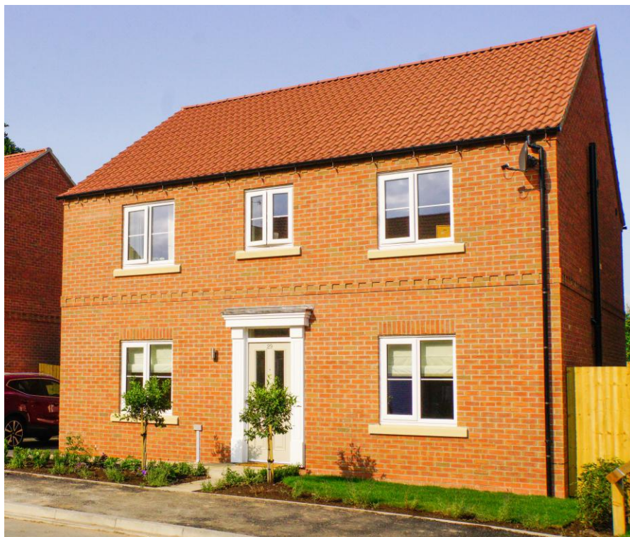
Red Pantile Barlby near Selby