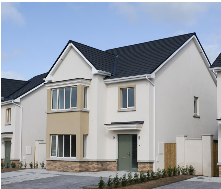
Black Senior Slates Tullamore